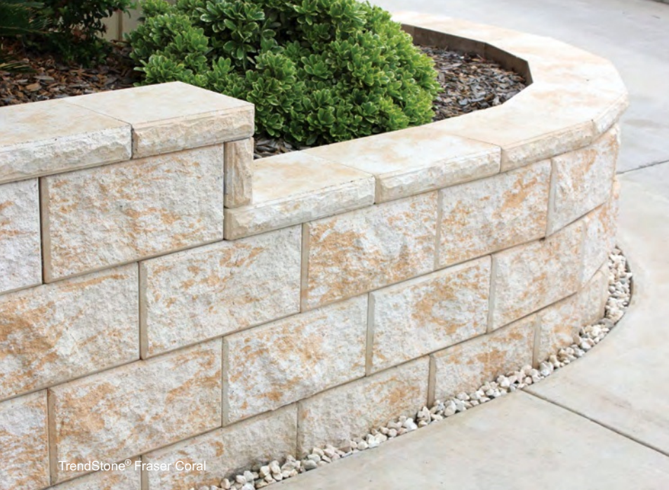
TrendStone® Fraser Coral