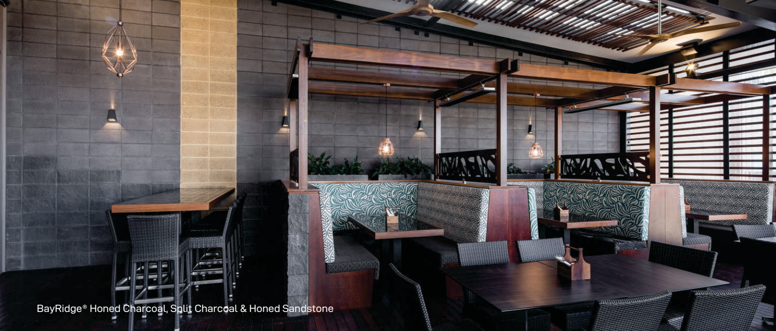
BayRidge® Honed Charcoal, Split Charcoal & Honed Sandstone