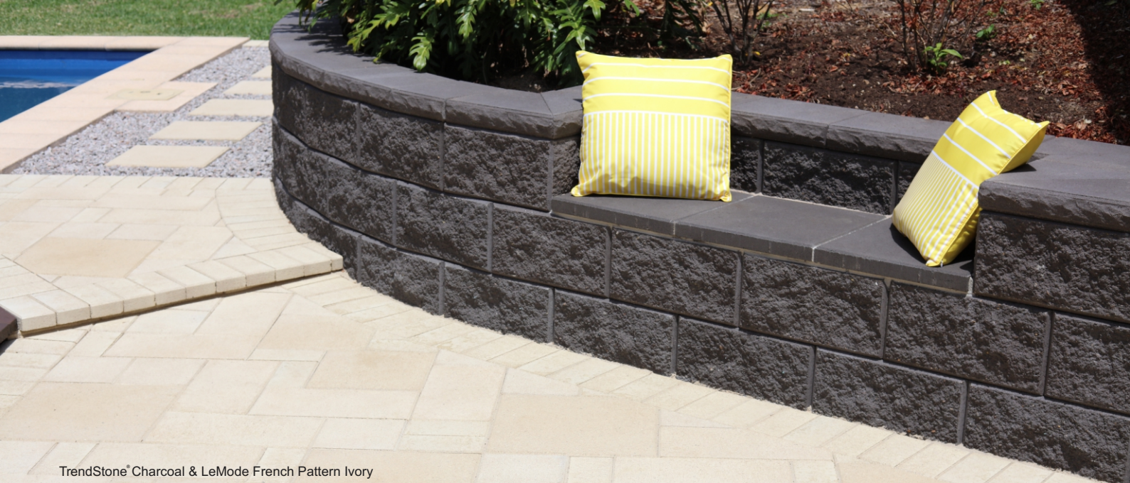
TrendStone® Charcoal & LeMode French Pattern Ivory