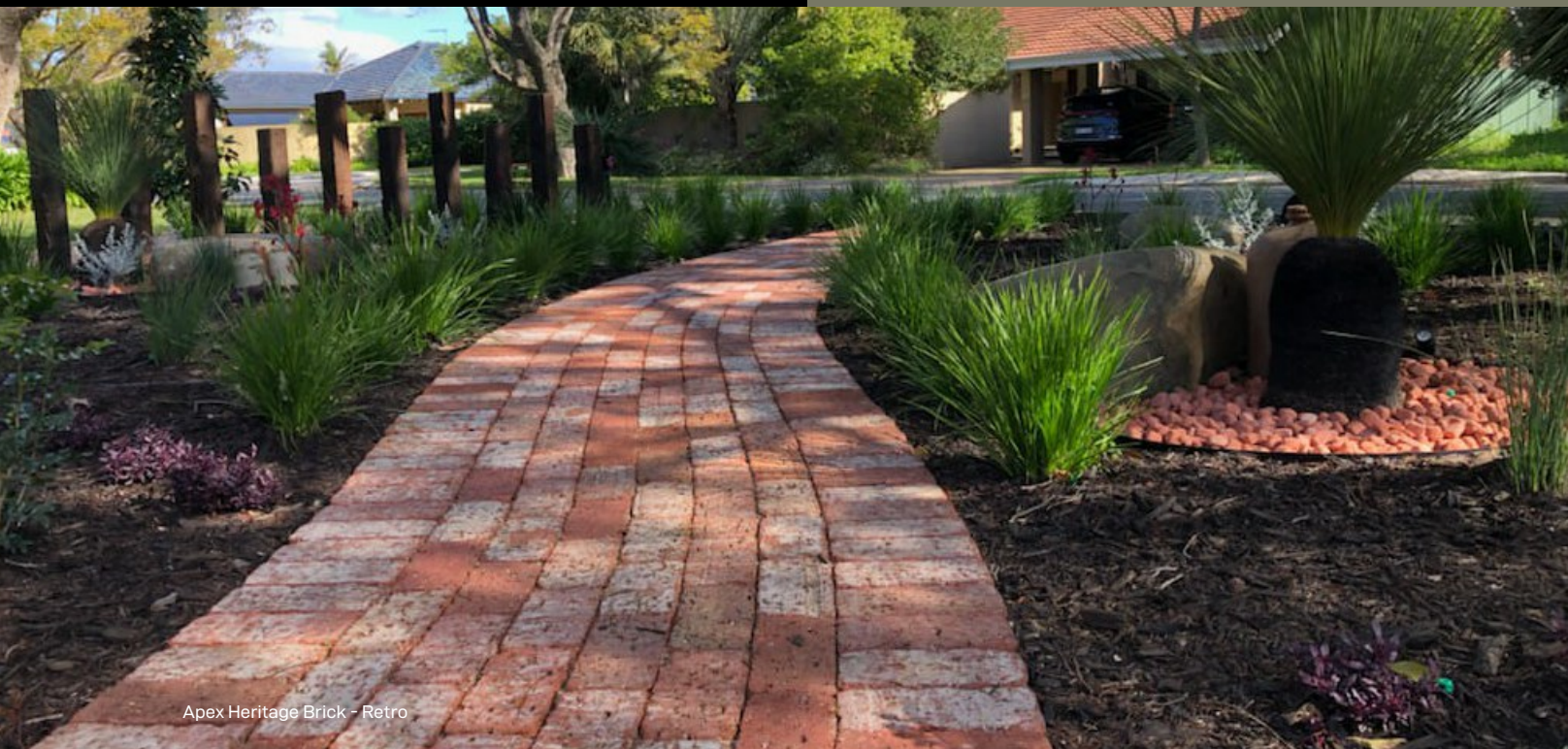
Apex Heritage Brick - Retro

Recycled-look Brick - The traditional & charming trend in renovation