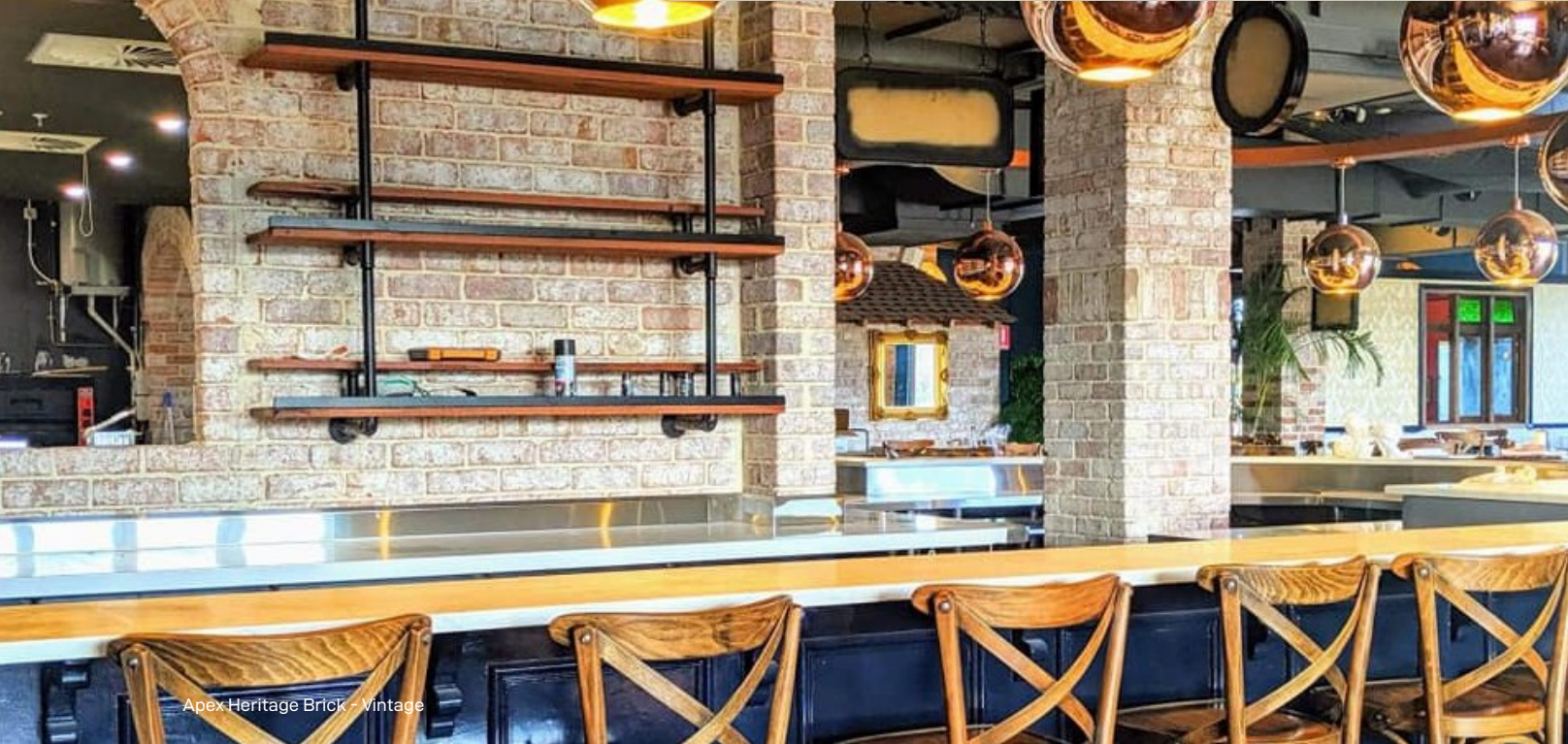
Apex Heritage Brick - Vintage